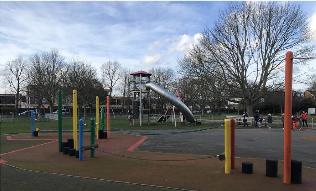
Figure 1 Older childrens’ play area

There is a paddling pool on site, which undergoes yearly maintenance and is opened in the summer months when the temperature feels like 20 degrees Celsius.