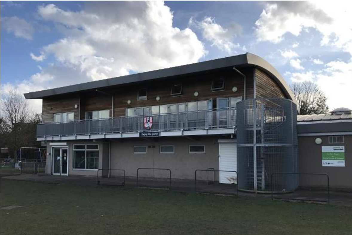
Figure 2 The Pavilion

A modern new pavilion building opened in 2011. This offers a large community hall, café, changing rooms, toilets with disabled access, a covered balcony terrace and outdoor seating.