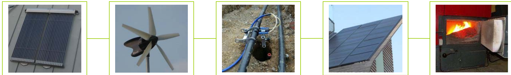
Left to right: Solar thermal collector, building-mounted wind turbine, ground loop for heat pump, solar PV panels, wood fuel heating

Renewable energy should be integrated with energy efficient design and technologies for maximum benefit.