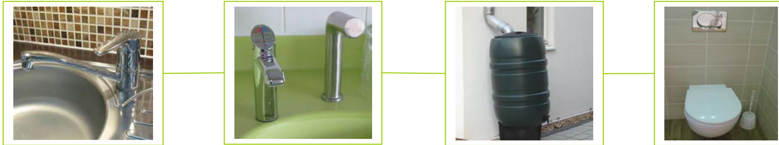
Left to right: Low flow kitchen and bathroom taps, rainwater butt connected to drainpipe, dual flush WC

The South East of England is one of the driest parts of the country and experiences high levels of water demand. In some areas the existing balance of supply to demand is very sensitive, with demand close to exceeding currently available sustainable supply. This issue can be addressed through use of water efficient sanitaryware and through installing simple measures such as a rainwater butt.